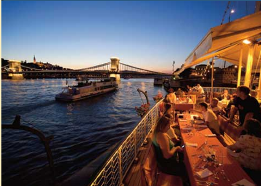
A dinner cruise on the Danube River in Budapest

Text by Bonnie Tsui